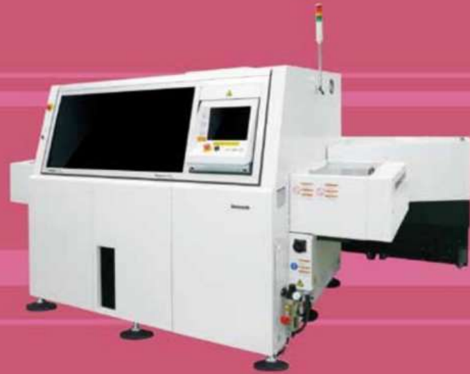
Model No. NM-EJR4A