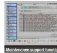
Maintenance support function