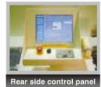
Rear side control panel